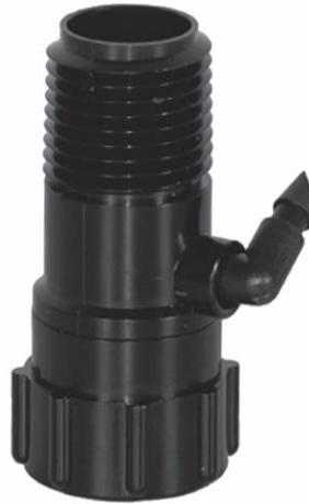
RPRA250-1 1 Barbed Outlet