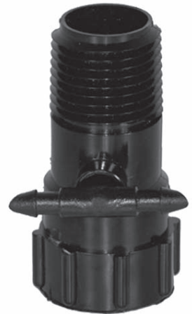
RPRA250-2 2 Barbed Outlet