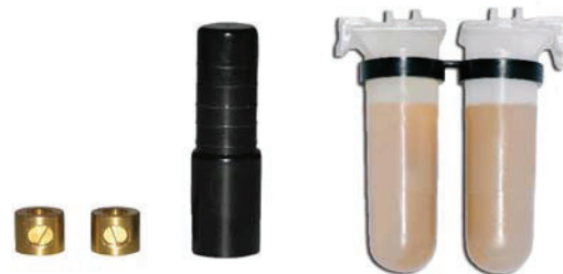
DBC-BR Logic receiver waterproof brass splice kit with direct bury gel filled housing for receiver to Two-wire path connection.