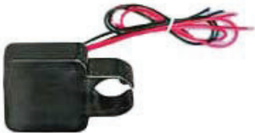
P2-D ProTwo 2 wire decoder