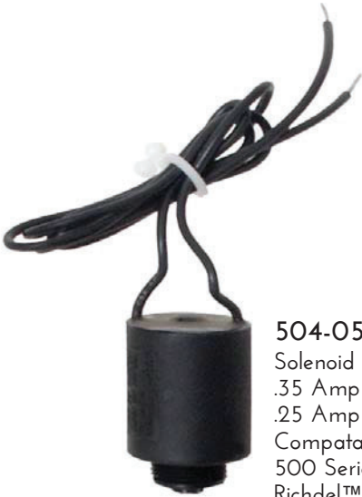
504-050 Solenoid 24 VAC 60 Hz .35 Amp Inrush .25 Amp Holding Compatible with 200, 300, 500 Series, Jar Top, and Richdel™, Hardi™, Irritrol™ valves