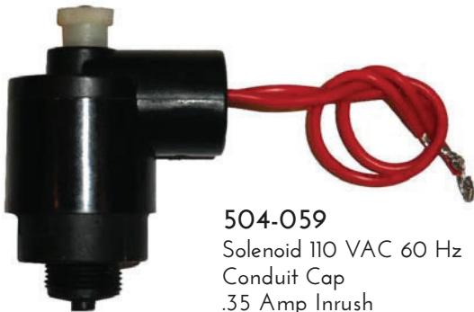
504-059 Solenoid 110 VAC 60 Hz Conduit Cap .35 Amp Inrush .25 Amp Holding