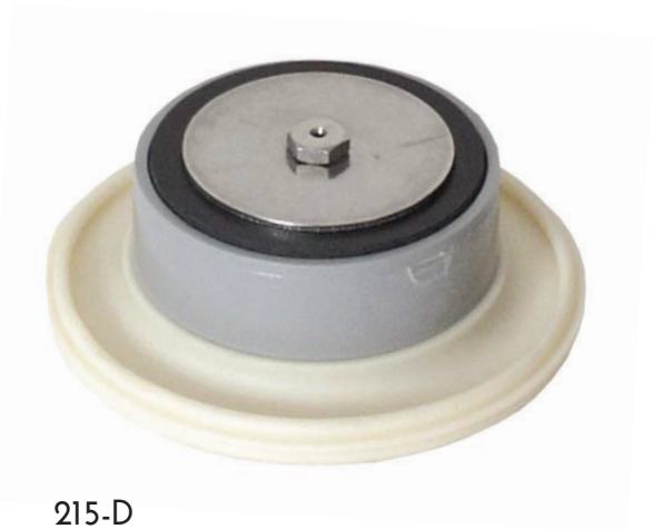
215-D 1 - 1/2" Diaphragm Assembly for 200 series PVC valves. Also compatible with Richdel™, Hardie™, Irritrol™ 216 series valves