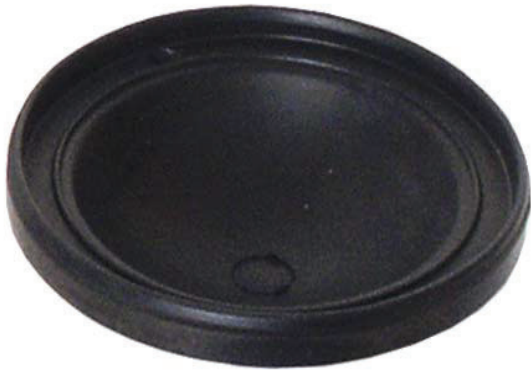
391-115 1" Diaphragm for HIT 310 and 500 Series non-flow control valve