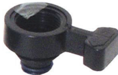
222 Universal Manual Bleed Adapter Includes: Manual bleed adapter, handle and O-ring