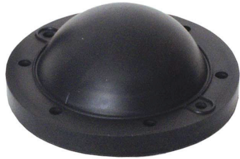
391-200 2" Diaphragm for HIT 500 Series flow control valve